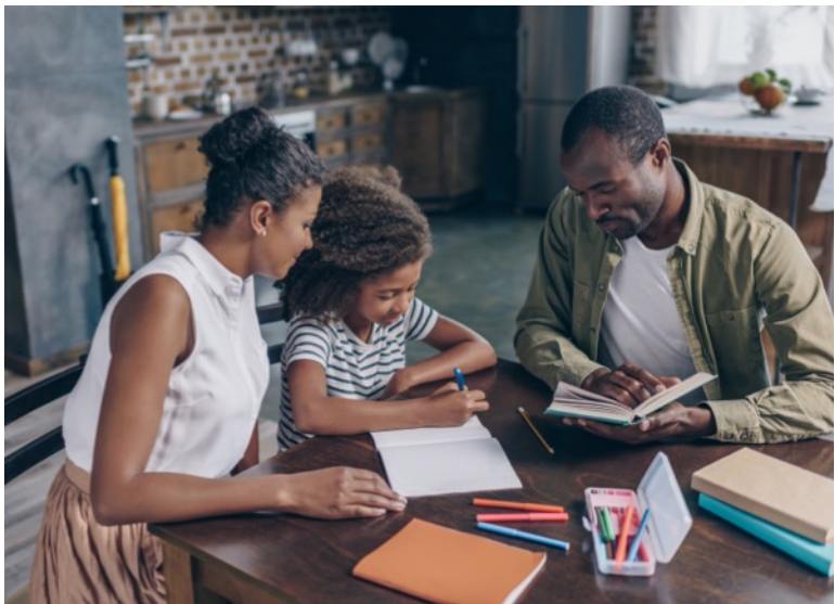
Not all students live in a home with a supportive homework environment.

Clearly, there are many good and bad aspects to homework for students. Until we know more, teachers should be careful about giving homework to their students.